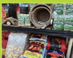
Winter Essentials Logs, Coal and Winter Grit