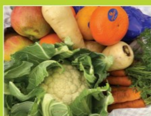
Fresh Fruit and Veg Available