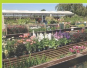
Hardy Plants Great Selection