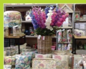
Gifts Inspiring Ideas