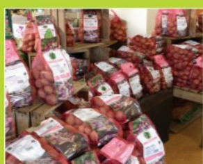
Seed Potatoes Now in stock