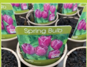
Spring Potted Bulbs Ideal time to plant