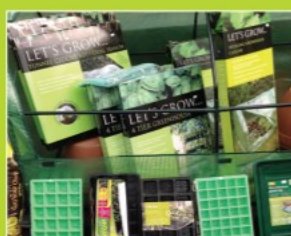
Grow Your Own All you'll need for your garden