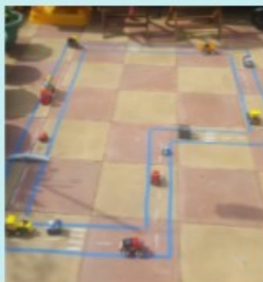
Make your own racetrack with duck tape.