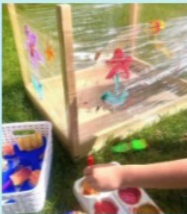
Painting on cling film.

Play animal/ toy hide and seek in the garden.