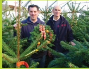
Trees & Wreaths Individually Hung