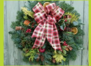
Christmas Workshop Tuesday 17 th December 10.00am - 1.00pm Wreath or Table Decoration £35pp please pre-book

In aid of Katharine House Hospice, Dogs for Good and St Mary Magdalene Church