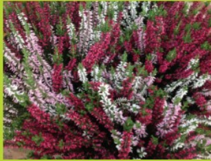
Plants Wonderful Selection