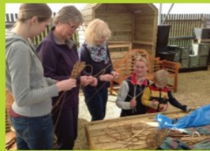
Festive Shopping and Workshop Day Saturday 9 th November 11.00am - 3.00pm Workshop, Christmas Demo Food and Drink Tasting