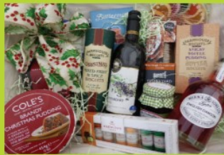
Gifts, Food and Decorations Inspiring Ideas