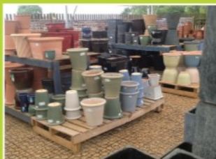
Pots Wonderful Selection