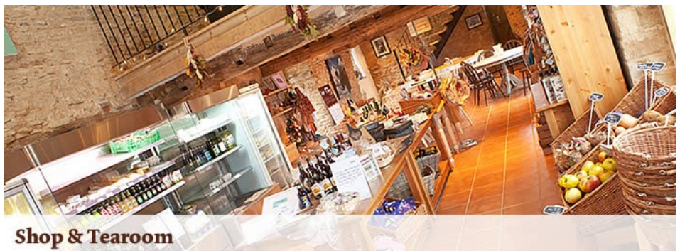
Shop & Tearoom

If you are looking to make your trip out multi-purpose, then you will be pleased to read that Limes Farm also carries a nice selection of edible goodies to take away, as well as a good variety of greetings cards and gift ideas.