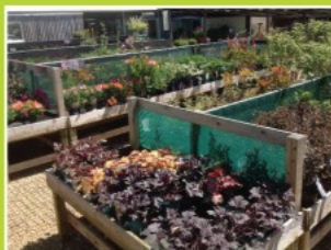
Plants Spoilt for Choice