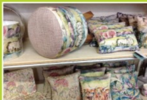
Gifts Great Range