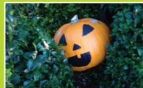
FREE Pumpkin Hunt Monday 28th October - Friday 1st November 10.00am-3pm