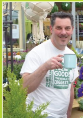
Macmillan Coffee Morning Friday 27th September 9.30am-12 noon

Join us for ... Delicious cake and coffee, raffle and lots more