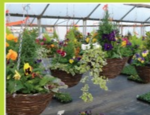
Winter Hanging Basket Workshop Thursday 19th September 10.30am or 7pm Pre-book

Join us for ... Delicious cake and coffee, raffle and lots more