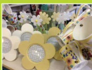
Gifts Inspiring Ideas