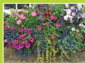
Hanging Baskets and Pots Created Here