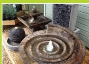
Water Features Great in any Garden