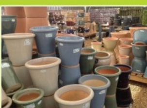
Pots Great Range