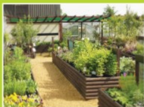
Garden Hardy Plants Wonderful Selection