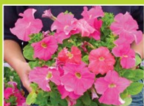
Bedding and Basket Plants Grown Here