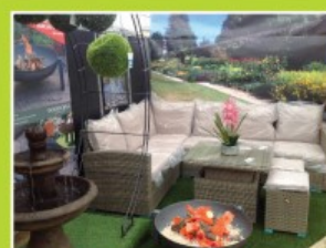
Garden Furniture Something for every Garden

Cost – materials and plants used Please pre-book