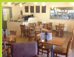
Greenhouse Café Sunday Roast 2 Courses for £14.95