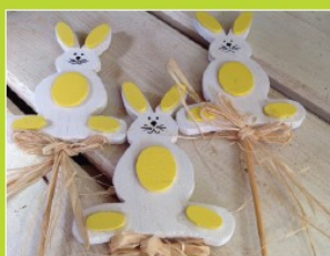
FREE Easter Bunny Hunt Tuesday 3 rd - Friday 6 th April