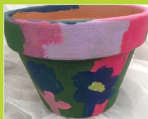
Paint a FLOWER POT