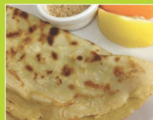
Pancakes Tuesday 13 th February

You can leave your pot and return on Saturday 10 th March and plant with a complimentary plant for Mother's Day