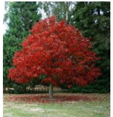
A Red Oak at 20 years