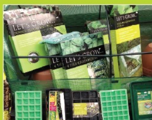
Grow Your Own