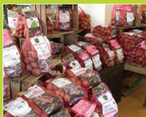
Seed Potatoes Now in stock